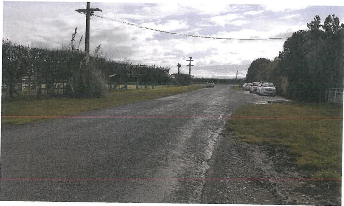
View from site frontage to the north toward the intersection with Otene Road (photo taken 03.07.2017)