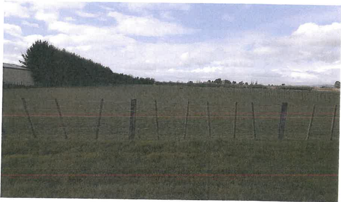
The site. View from Bennett Road toward the east. (photo taken 03.07.2017)