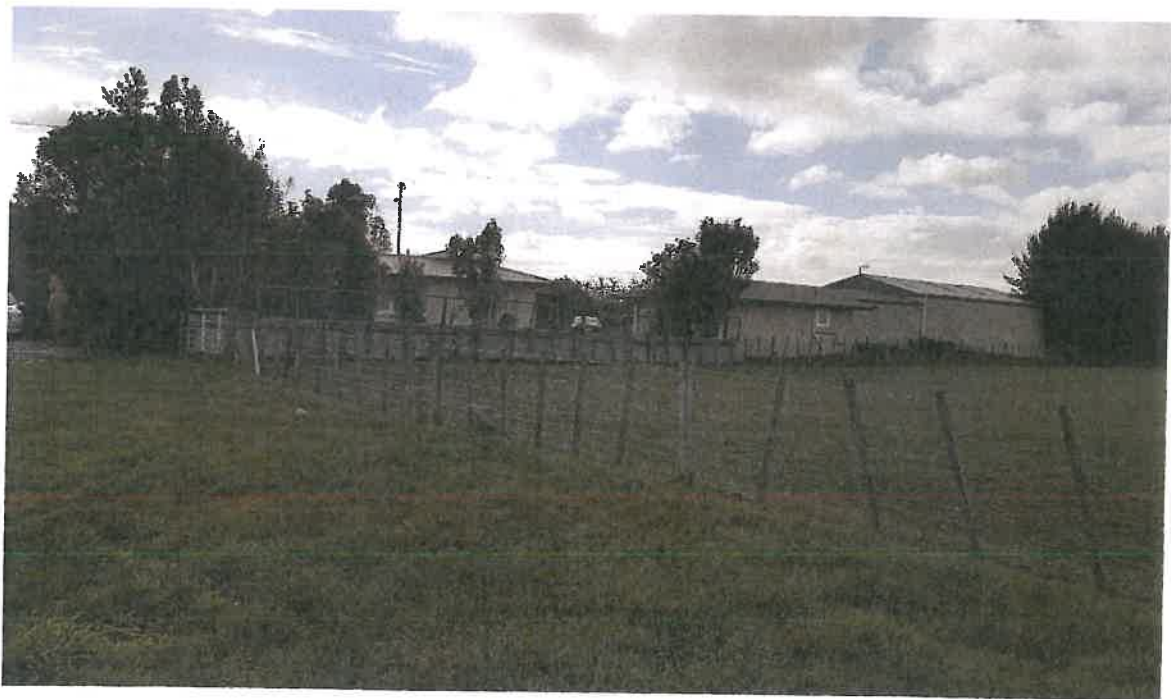
View from site frontage toward the adjoining property to the north (120 Bennett Road) (photo taken 03.07.2017)