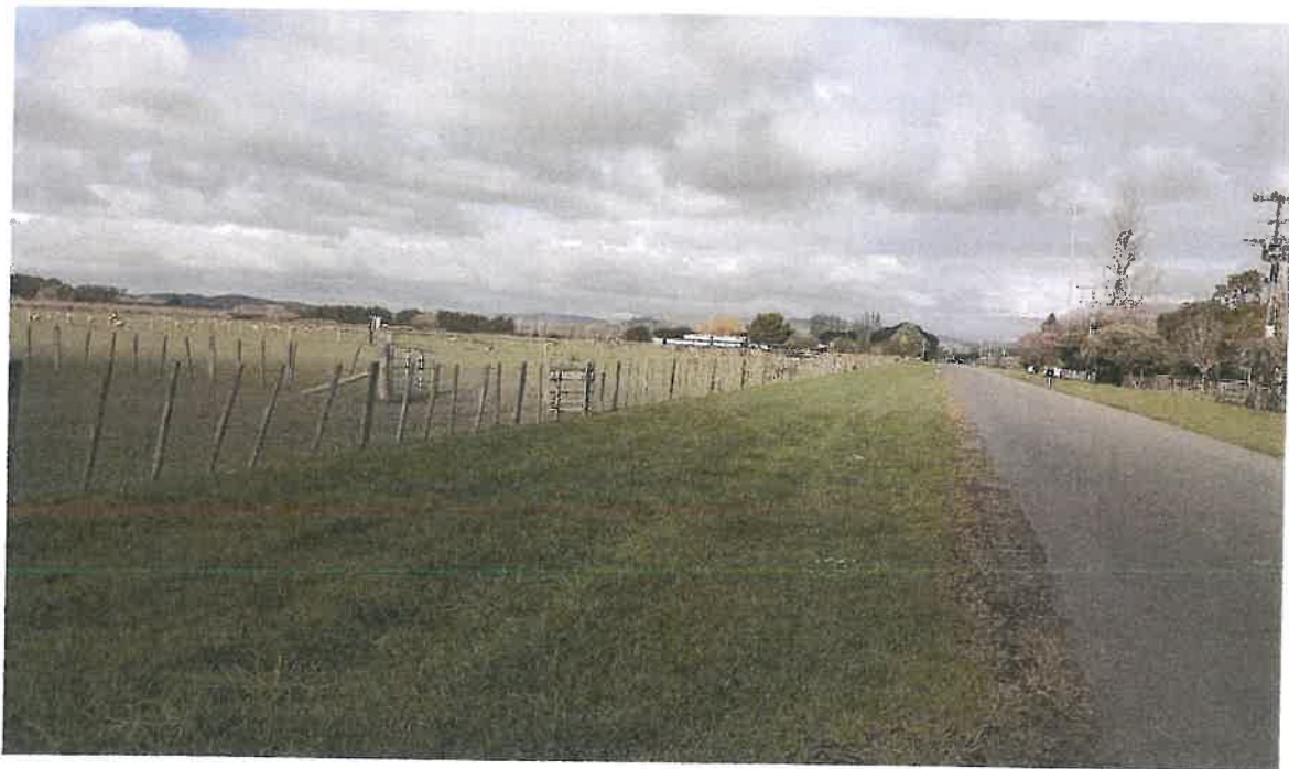
View from site frontage toward the south down Bennett Road (photo taken 03.07.2017)