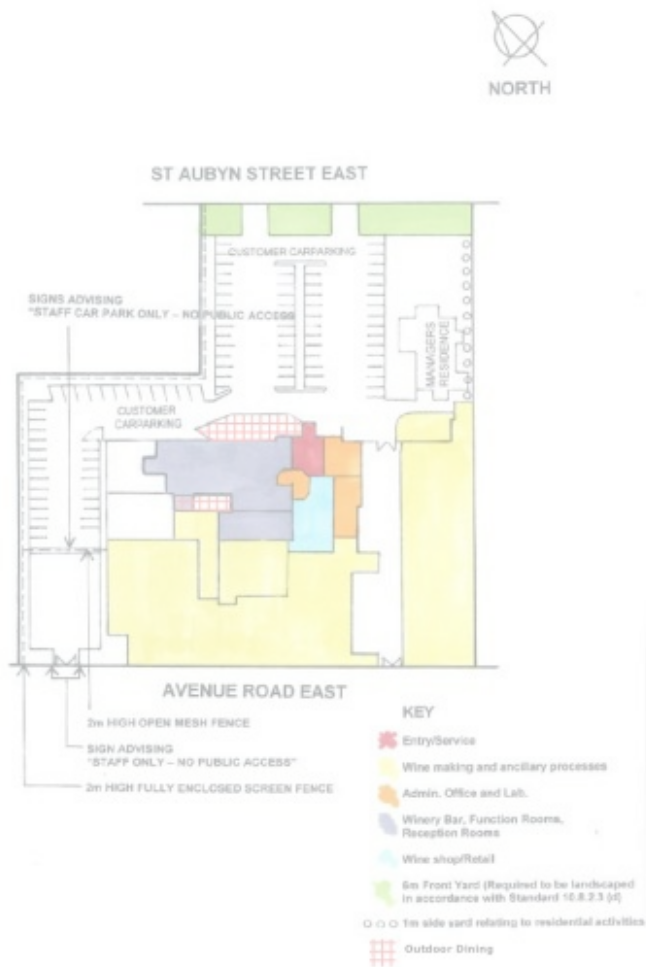
APPENDIX 26: SCHEDULED ACTIVITIES FIGURE 1: VIDAL 904 AVENUE ROAD EAST